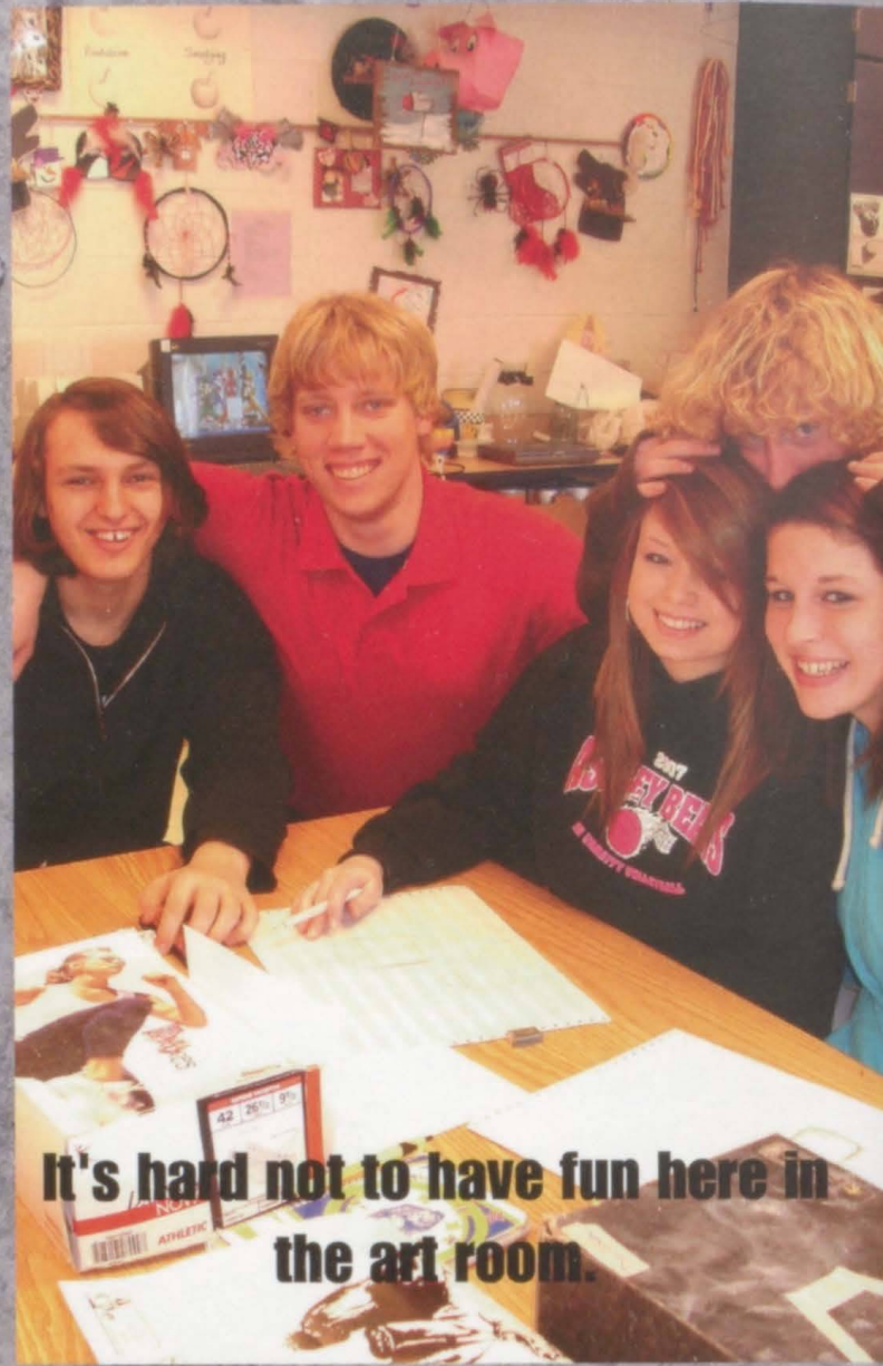
It's hard not to have fun here in the art room.